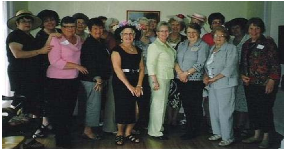
"Some of the gals made "fascinators" to wear in honor of the Royal Couple's visit to Eastern Canada."